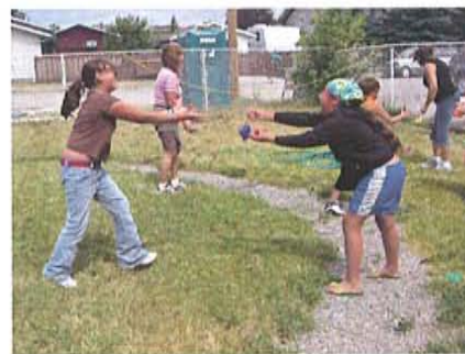
Champ Camp 2007 Napi Friendship Centre

Partner with friends, family and co-workers and support each other to take a "Healthy Living Step" Today!!!